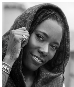
Brittney Reese Class of 2017 Olympic Medalist; Coach, San Diego Mesa College