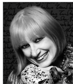
Zandra Rhodes Class of 2013 Fashion/Textile Designer