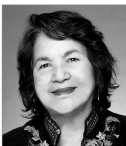
Dolores Huerta Class of 2013

Co-founder, United Farm Workers; President, Dolores Huerta Foundation