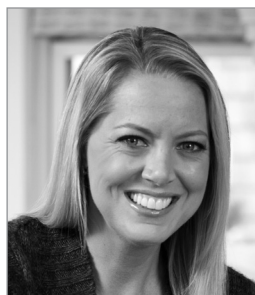
Melissa d'Arabian Class of 2014 Celebrity Chef, Author