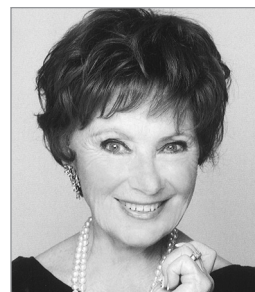
Marion Ross Class of 2011 Actress