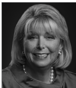
Lynn Schenk Class of 2017 Former U.S. Congresswoman; Attorney