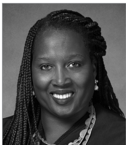
The Honorable Sherry Thompson-Taylor Class of 2024 Judge, San Diego Superior Court