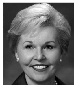
Gayle Edlund Wilson Class of 2010 Education Advocate First Lady of California (1991-1999)