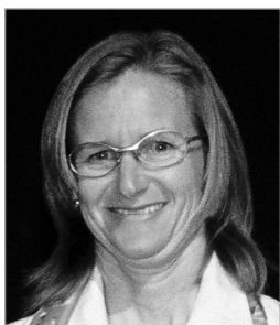
JJ Isler Class of 2002 Olympic Sailing Medalist, Author